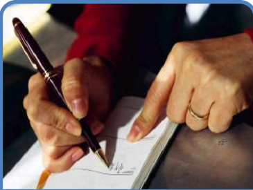
Business Plans and Reports