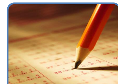
Time Constrained Assessment