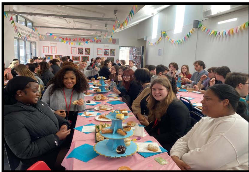
YEAR 13 GREGGSFEST AFTERNOON TEA